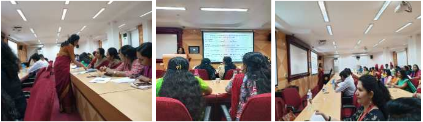
Internal Quality Assurance Cell organized Faculty Development Program on “Bloom’s Taxonomy and Rubrics on 17 th August, 2019