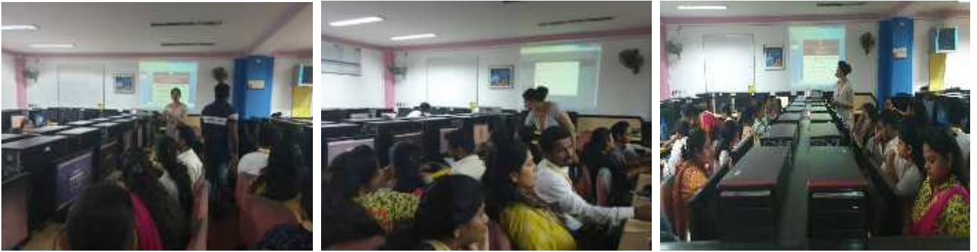
Internal Quality Assurance Cell organized Faculty Training Program on “Google Classrooms” on 9 th December, 2019